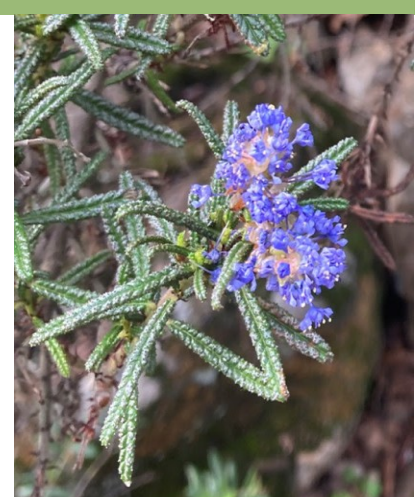
Ceanothus papillosus - wartleaf ceanothus, Reg. Parks Bot. Garden