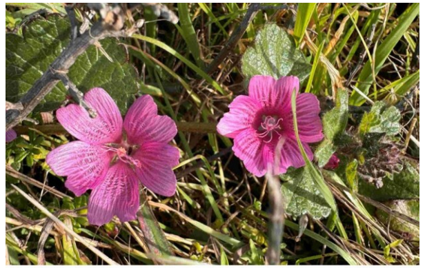
Sidalcea malviflora ssp malviflora - checkerbloom Chimney Rock Trail