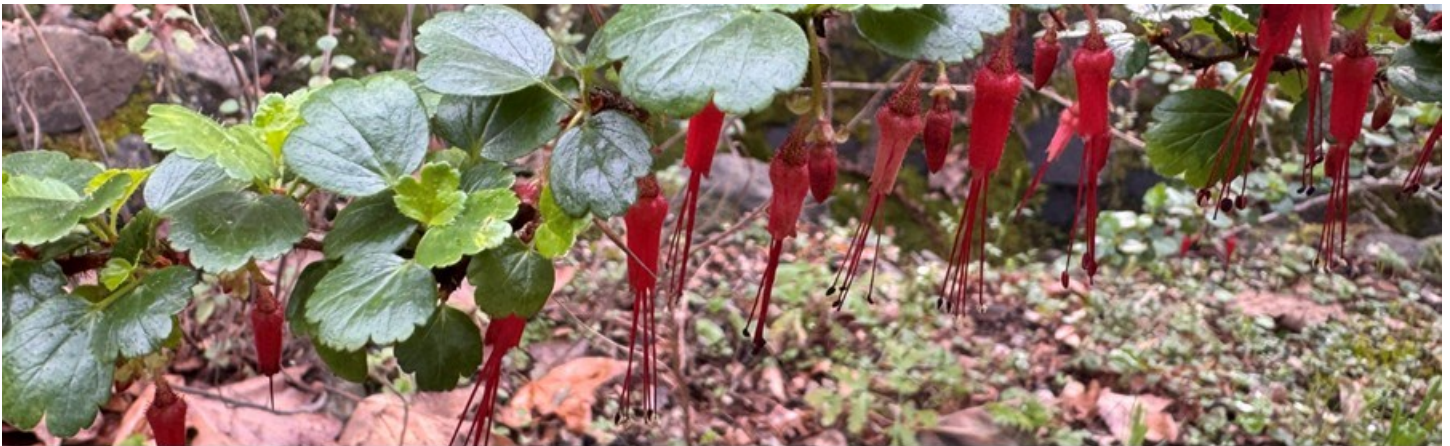
Ribes speciosum - fuchsia flowering gooseberry