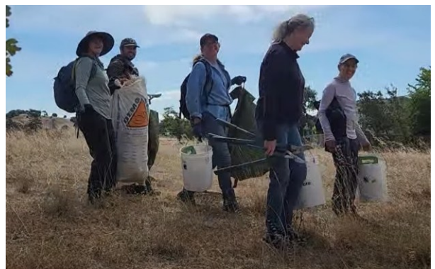
Looking forward to cookie reward after weed pulling at Mt. Burdell.