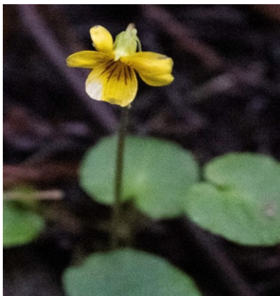
Viola sempervirens - redwood violet in Samuel P. Taylor SP