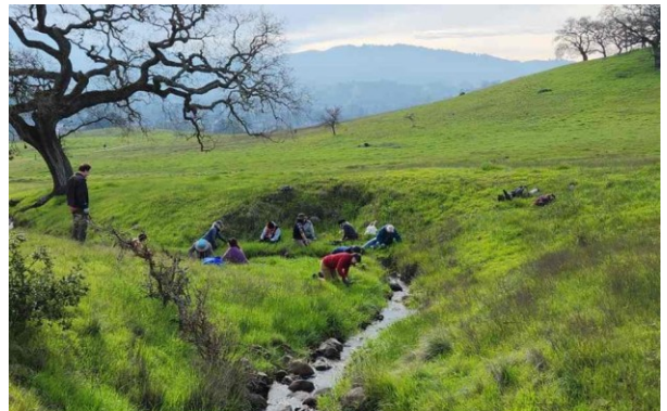
Milkweed planting in January on Mt. Burdell