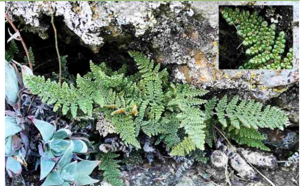
Myriopteris intertexta - coastal lip fern (bead fern) near Rock Spring