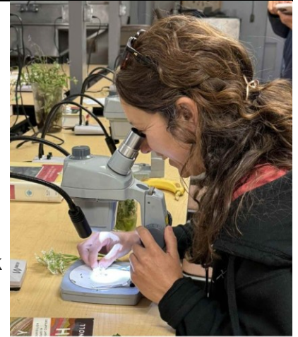
Plant keying sessions at Dominican.