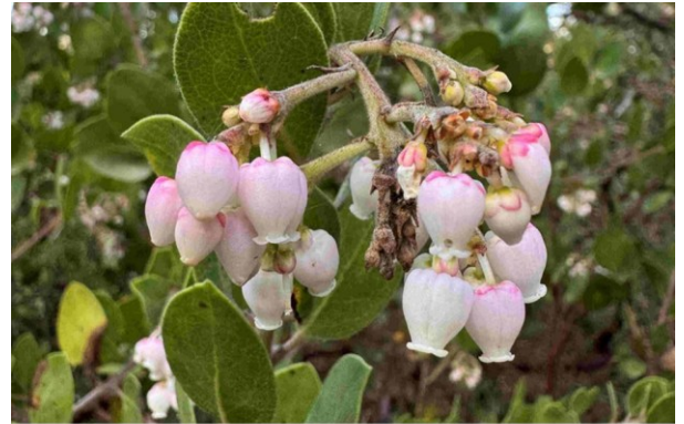
Arctostaphylos manzanita - common manzanita Rush Creek, Bahia Trail