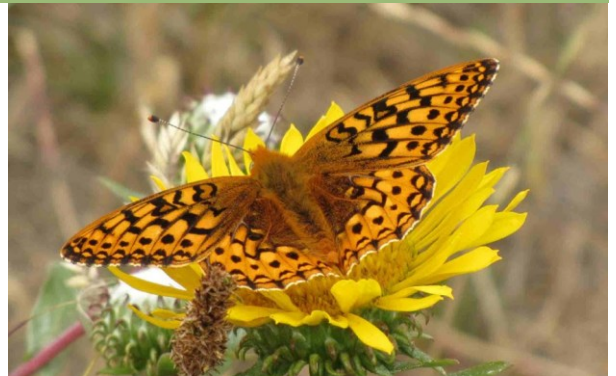
Myrtle's silverspot on gumplant