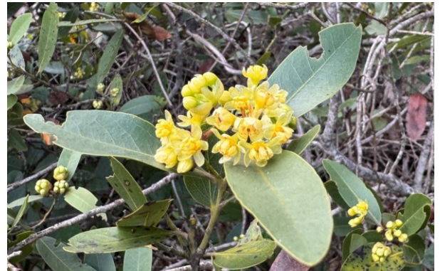
Umbellularia californica - CA bay laurel Rush Creek, Bahia Trail