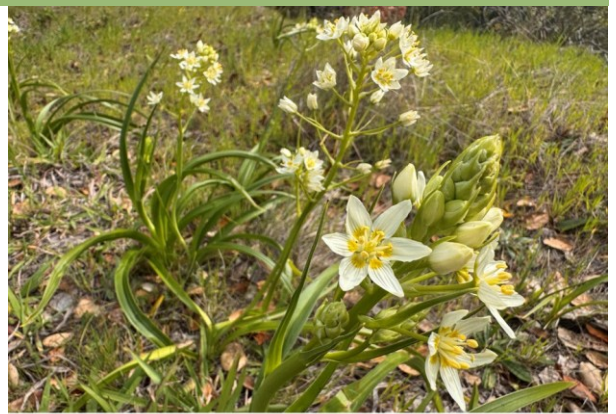
Toxicoscordion fremontii - zigadene lily Fairfax Bolinas Road