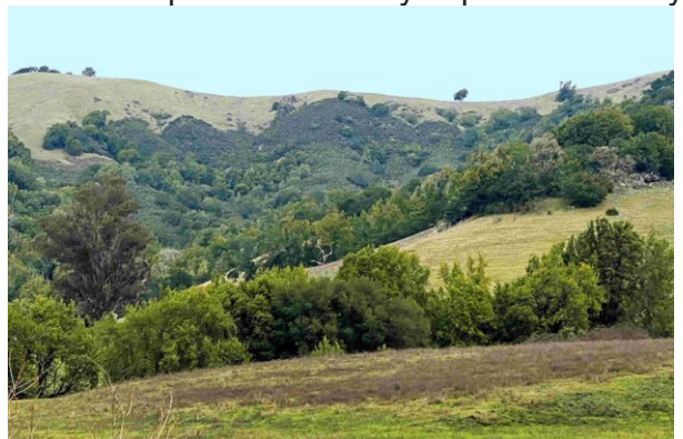
Vegetation "mosaic" in San Geronimo Valley