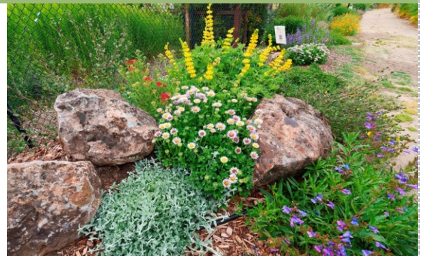
Native habitat garden near Town Park, Corte Madera by Refugia Marin