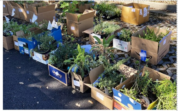
Fall plant sale orders are ready for pickup.

May your native gardens thrive and bring you joy.