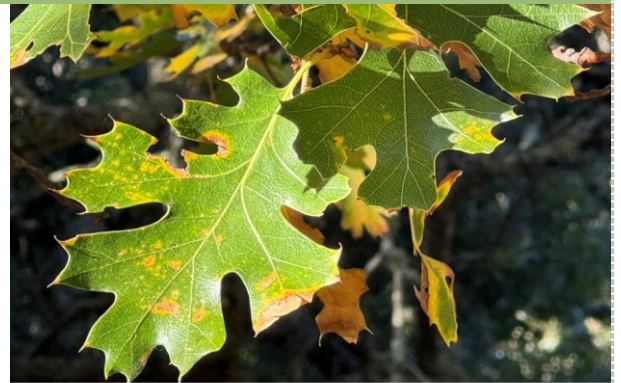
Quercus kelloggii - California black oak

Then a cold wind began to blow. Now I know-- you really do not see a tree until you see its bones.