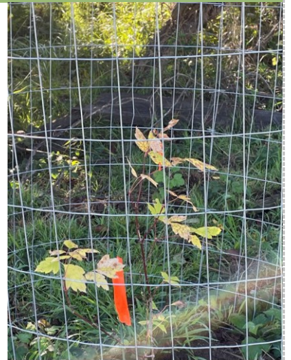
Acer negundo - boxelder

Join CNPS and Friends to weed the Alder Creek Preserve restoration site in Inverness.