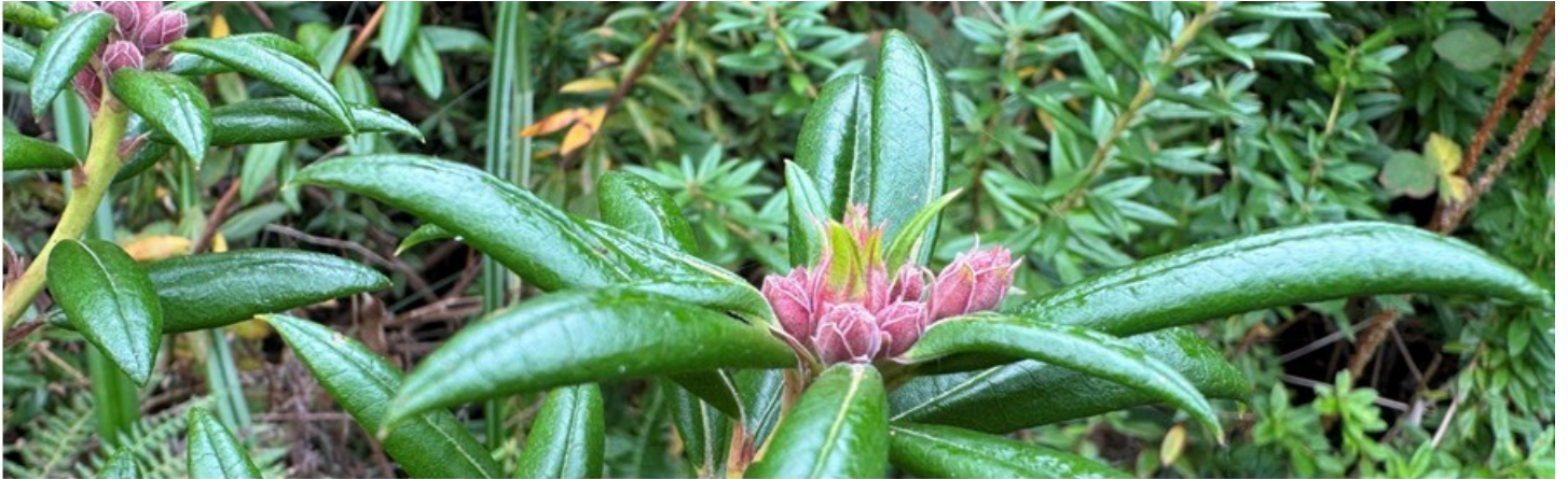
Rhododendron columbianum - western Labrador tea