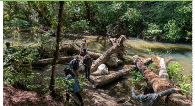
Sustainable Conservation at the Lagunitas Creek Watershed

Read more. . . Join us! Register for this Zoom meeting here.