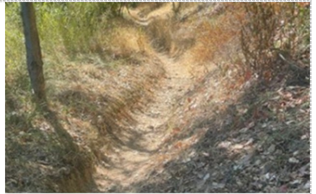
Intrenched section of the Concrete Pipeline Trail in Mt. Tamalpais watershed

Subscribe here to receive email notifications and updates from Marin Water about this and other elements of the RTMP process.