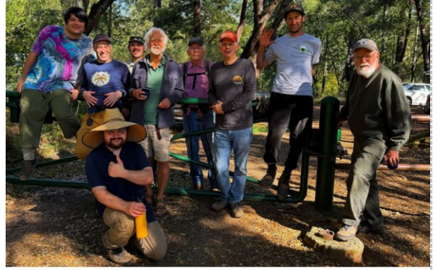
Broom Service volunteers

This week we will be continuing to meet and work at the Conifer Gate site in Woodacre. Conifer Gate is at the boundary between private property and public open space. Though many people hike, bike, or ride horses from the valley floor, the Gate is one of the entryways to the San Geronimo Ridge, a delightful wild recreational area open to all.