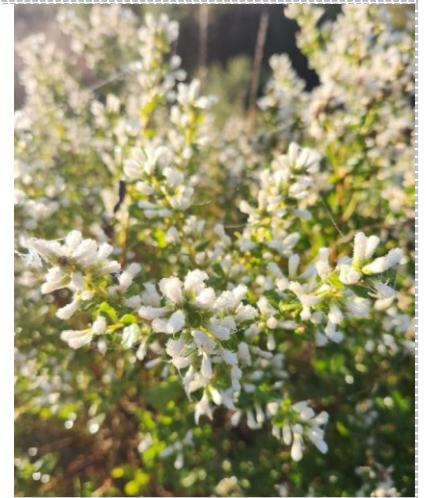
Baccharis pilularis - coyote brush flowers on female plant