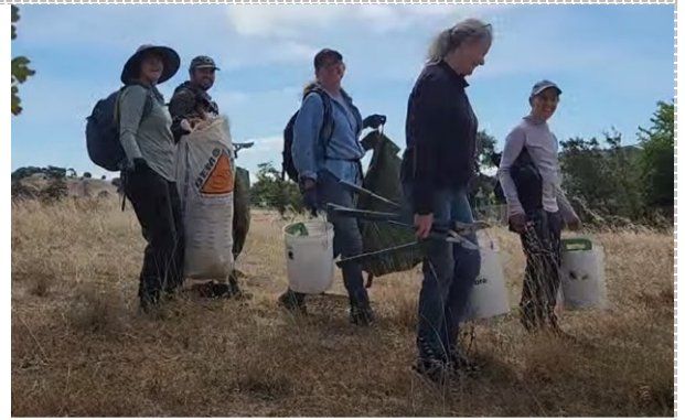
Looking forward to cookie reward after weed pulling at Mt. Burdell.