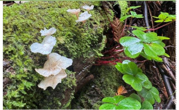
Oxalis oregana - redwood sorrel, moss, & fungus Samuel P Taylor SP