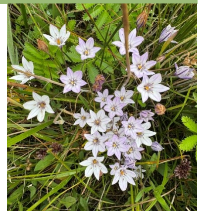
Triteleia peduncularis - long rayed brodiaea