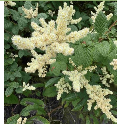
Holodiscus discolor - ocean spray