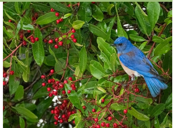
Heteromeles arbutifolia - toyon enjoyed by Western bluebird

Starting a garden renovation can be overwhelming; it is hard to look past what exists now towards the native habitat garden that could be. In some situations, it makes sense to develop a garden design and implement all the changes at once. For others, working gradually to transform a garden may be the best path: adding native species each winter, removing invasive species, and seeing how the garden adapts over time. Nita Winter and Rob Badger took this gradual approach to transform their Marin City yard into a delightful habitat garden.