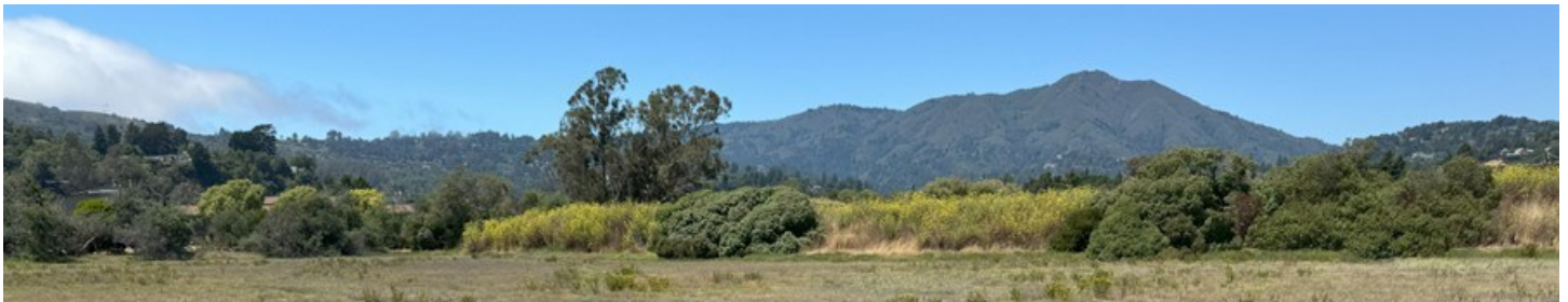
Mt. Tamalpais from Bothin Marsh