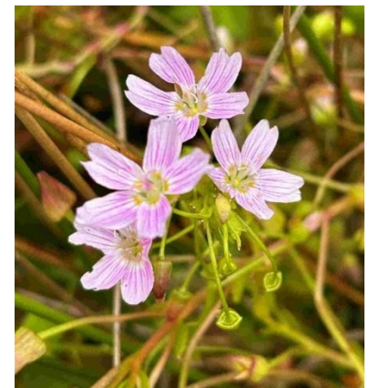
Claytonia sibirica - candy flower Delynne Cullen

Read more about the other treasures we found here.