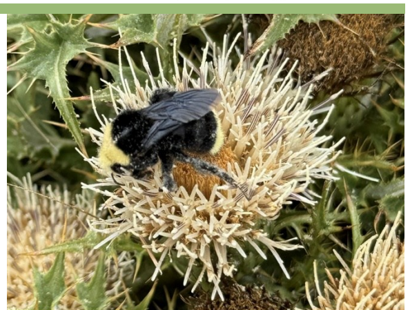
Bombus vosnesenskii - yellow-faced bumblebee on Cirsium quercetorum - brownie thistle Ann Elliott