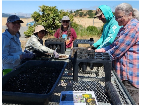
Volunteers at Novato Baylands Nursery

Please join Point Blue Conservation Science staff and CNPS members at the Novato Baylands for our second nursery workday of the summer! The Novato Baylands is a 2,600-acre restoration site consisting of a mosaic of tidal marsh, seasonal wetlands, and upland habitat. This is an amazing project, transforming/restoring a military airfield to a thriving wetland. Activities include potting up native plant seedlings and weeding within plant containers. Attendees will learn how their efforts will increase biodiversity on the site and enjoy good plant conversation. Point Blue staff will also give a short overview of the history of the restoration.