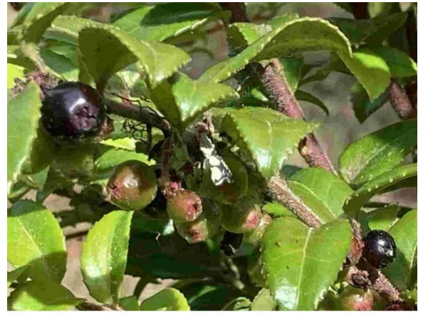
Vaccinium ovatum - huckleberry berries early August Ripe soon?

During late summer, the Jepson & Johnstone Trails come alive with the fruits of fall. We will eat huckleberries, marvel at the fruit on the California honeysuckle, enjoy a variety of ferns, search for the CNPS Listed 1B Eastwoodiella californica (marsh harebell), and have lunch at beautiful secluded Pebble Beach. If the weather is nice consider a swim in Tomales Bay at our lunch spot.