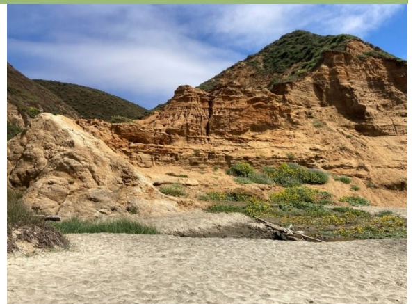
Coastal Bluffs at McClures Beach, Point Reyes National Seashore

Read more. . . Join us! Register for this Zoom meeting here.