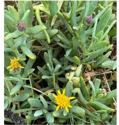
Jaumea carnosa - marsh jaumea

Read more about the restoration project, the saltmarsh, intertidal plants, and cliff habitats.