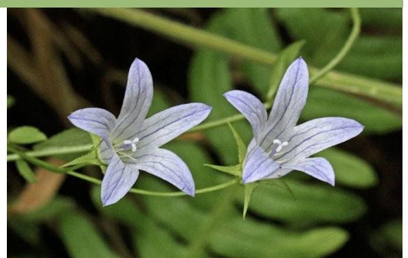
Eastwoodiella californica - marsh harebell by Vernon Smith (formerly Campanula californica )