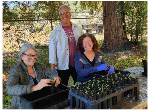
Transplanting seedlings at Marin County Parks native plant nursery

Read more including directions. . . Meetup Registration Link