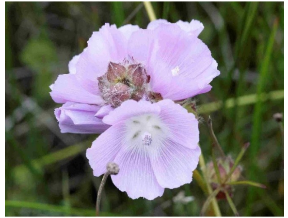
Sidalcea calycosa ssp. rhizomata - Point Reyes checkerbloom