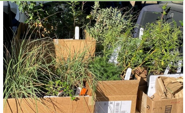
native plant orders ready for pickup by Laura Lovett