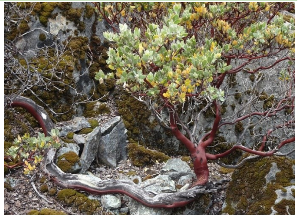
Arctostaphylos montana - Mt. Tamalpais manzanita growing on serpentine, North Side Trail, Mt Tamalpais SP

which includes Marin Country, was established in 1988 to represent the California Floristic Province in the global network. It is the largest, most populous, and perhaps most complicated of the twenty-eight US biosphere reserves, with fascinating success stories to tell and lessons to teach. This talk will feature highlights from the book Nature on the Edge regarding the history of the Golden Gate Biosphere Region, the heroes/heroines who fought to conserve its biodiversity over more than a century, and will give a few examples of native plant research and restoration going on now. Examples will include manzanitas and their relationship to serpentine soils; fire ecology of bishop pine at Point Reyes; restoration of native sand dune