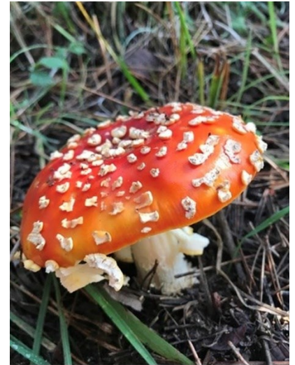
Amanita muscaria - fly agaric