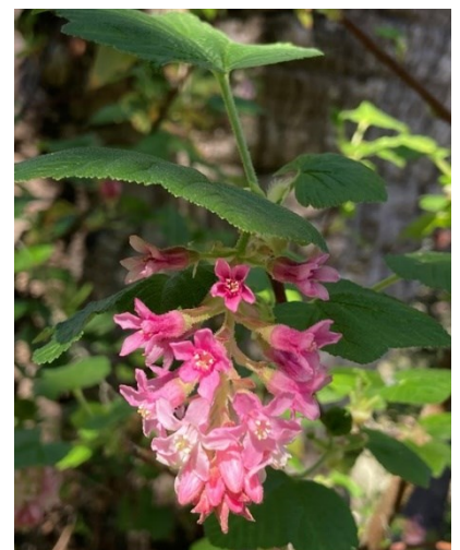
Ribes sanguineum - pink-flowering currant

Also check the Events Calendar for Marin County Parks . They host a variety of local hikes, service projects, and presentations.