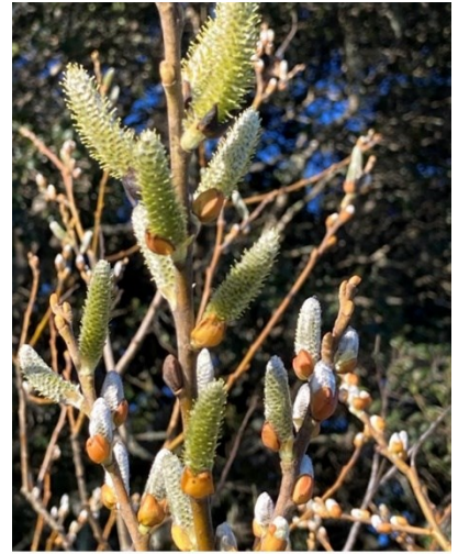
Salix lasiolepis - arroyo willow Chicken Ranch Beach