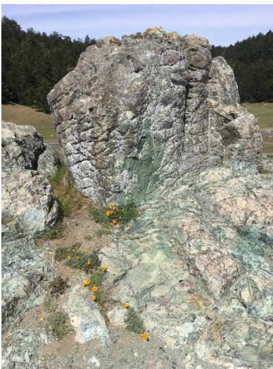
Serpentine outcrop with poppies near Rock Springs, Mount Tamalpais