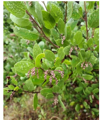
Arcotostaphylos manzanita - common manzanita, Turtle Back NT

Read more. . . Meetup Registration Link opens Jan. 5.