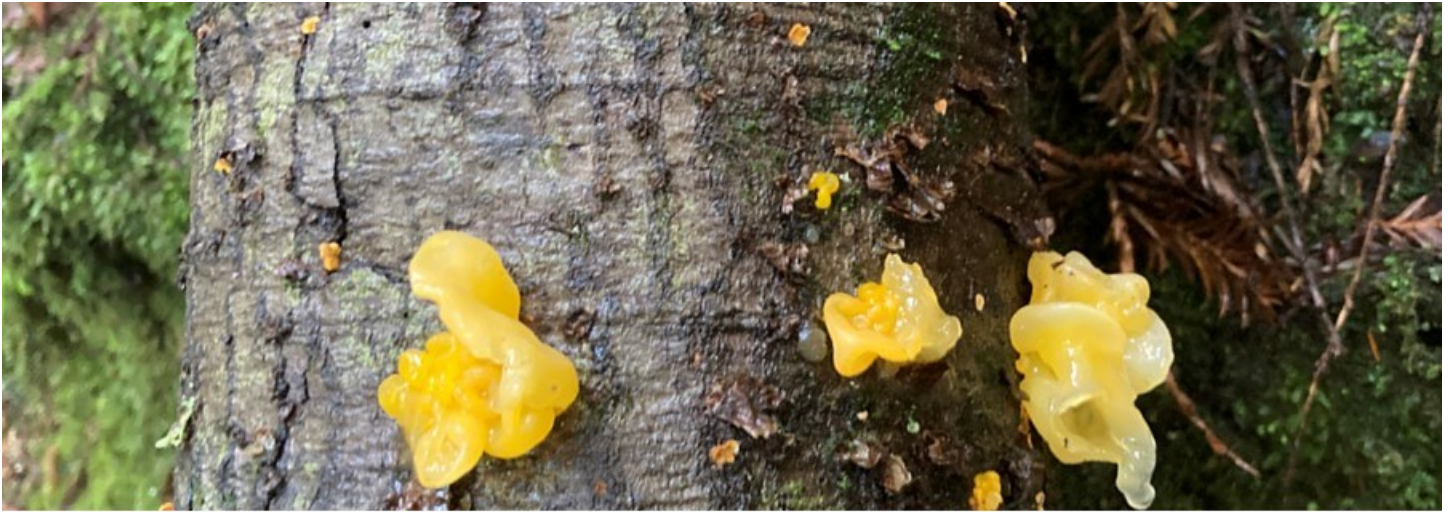
fungus (may be Dacrymyces chrysospermus - orange jelly spot), Mt. Tamalpais