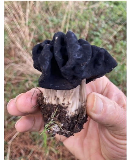
elfin saddle fungus