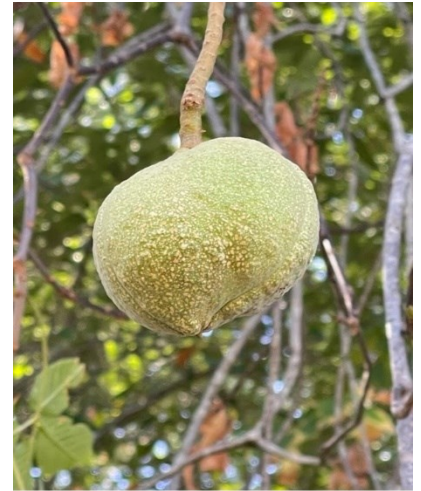
Aesculus californica - CA buckeye drupe in Marin Highlands