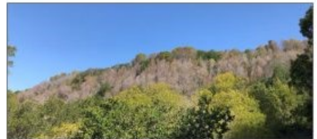
Leona Heights, Oakland, April 2021. Acacia dieback