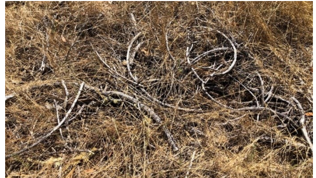
Broom piles that were cut and left several years ago are now almost completely broken down; returning to soil. What remains easily crumbles underfoot.

Broom Service volunteers meet Thursday mornings to pull invasive broom (mostly French broom) from natural areas in San Geronimo valley and surrounding hills. Broom can develop dense stands and threaten western azalea, grassy meadows, and mixed evergreen forests in the area. Text Mel Wright to find out how to join their efforts. 415-999-4736