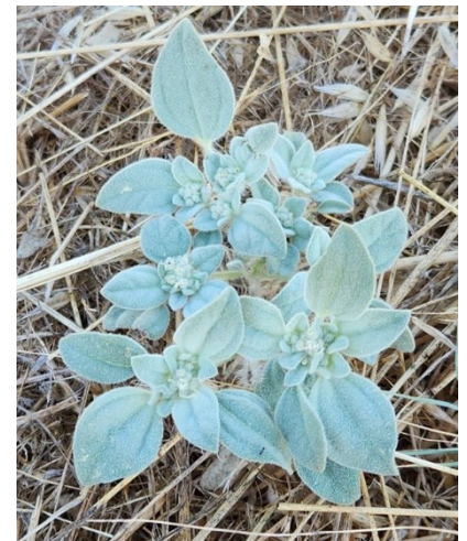
Croton setiger - doveweed or turkey mullein