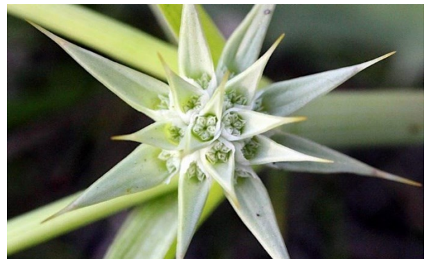
Eryngium sp. - coyote thistle

Sign up for free events throughout the day.