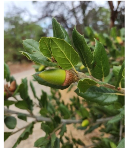
Quercus agrifolia - coast live oak on Hamilton's Reservoir Hill