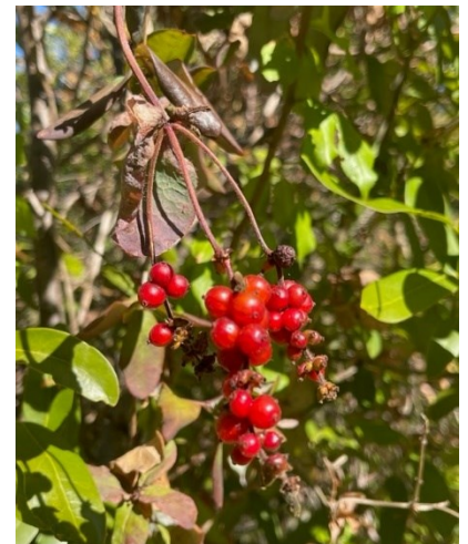
Lonicera hispidula - pink honeysuckle berries in Marin Highlands

One yard had an attractively pruned Q. agrifolia that sported acorns! This oak can be a happy landscaping plant and support wildlife too!