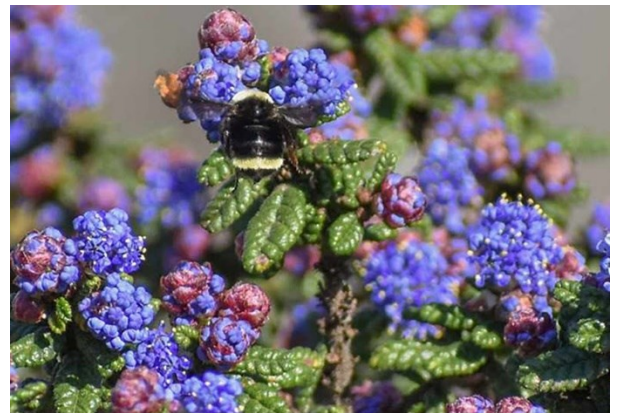
Ceanothus 'Dark Star'

Access to the online sale will be available on our website at the Store link at the bottom of each page. The plant sale will go live at 6 pm on October 10. Do not be surprised if there are no plants listed before then. We will send everyone an email closer to the date.