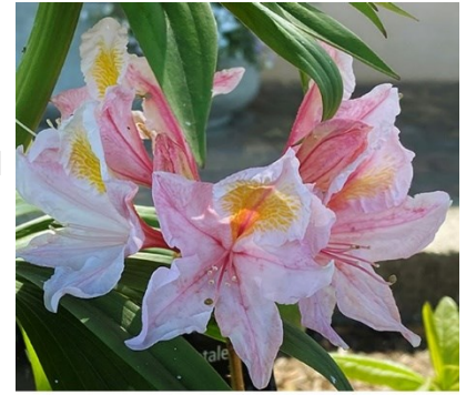
Rhododendron occidentale - Western azalea