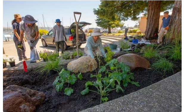
Board members and other volunteers build the Bay Model Garden in 2018.