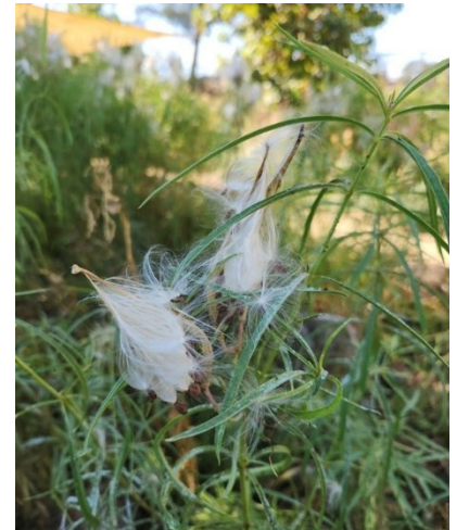
Asclepias fascicularis - narrowleaf milkweed seeds at Marin County OSD nursery