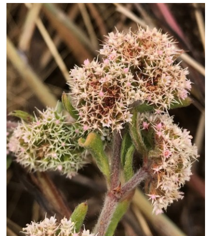
Chorizanthe cuspidata - San Francisco spineflower near Abbotts Lagoon, Point Reyes NS