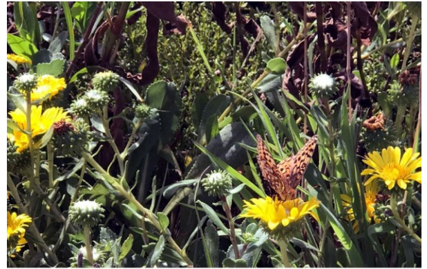
Point Reyes Silverspot butterfly on gumplant near Abbotts Lagoon