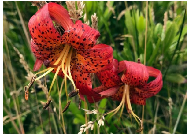
Lilium pardalinum - leopard lily Bull Point, Point Reyes NS