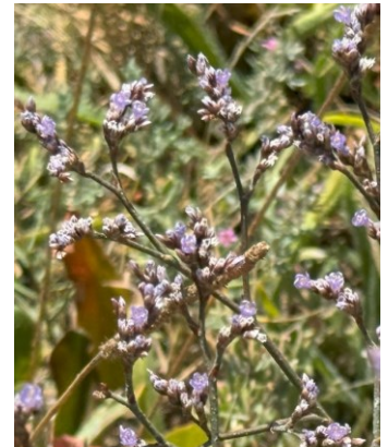
Limonium californicum - marsh rosemary in Bothin Marsh