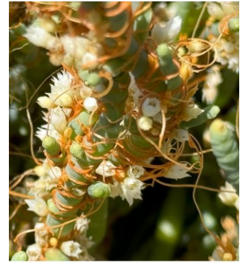
Blooming Cuscuta salina - saltmarsh dodder wrapped around Salicornia pacifica - pickleweed in Bothin Marsh by Ann Elliott