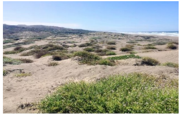
Point Reyes NS dunes with European sea-rocket

Email Anela Kopshever with the subject "Habitat Restoration Volunteer" to pre-register. Note what date(s) you plan to attend. However, drop-in volunteers are welcome! All volunteers are required to fill out a National Park Service Volunteer Agreement Form. Forms will be available the day of the volunteer event.