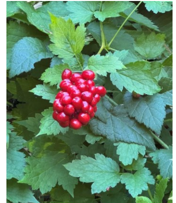
Actaea rubra - red baneberry in Samuel P. Taylor State Park