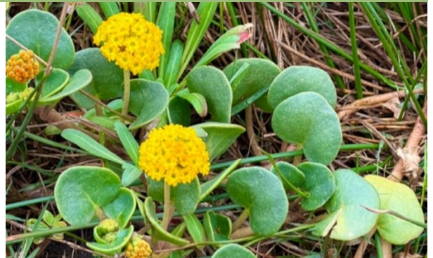
Abronia latifolia - yellow sand verbena in Tennessee Valley