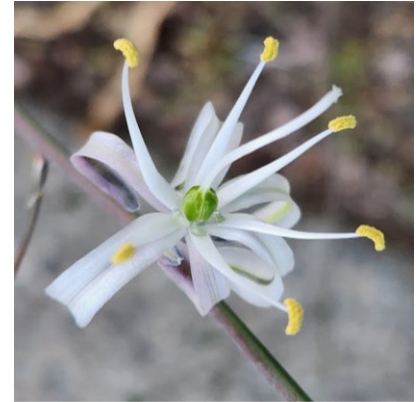
Chlorogalum pomeridianum - soaproot

Geologic highlights are serpentinite outcrops and metamorphic rocks of basaltic origins in the upper portions and sandstone and shale formations on the lower slopes. The nutrient poor serpentinite supports rare plants like the Tiburon mariposa lily and Marin dwarf flax. Along our route, we will encounter an array of native plants and flowers depending on weather. Wavy-leaved soap plant blossoms start opening about 4 pm, which will make our descent from the mountain enchanting.