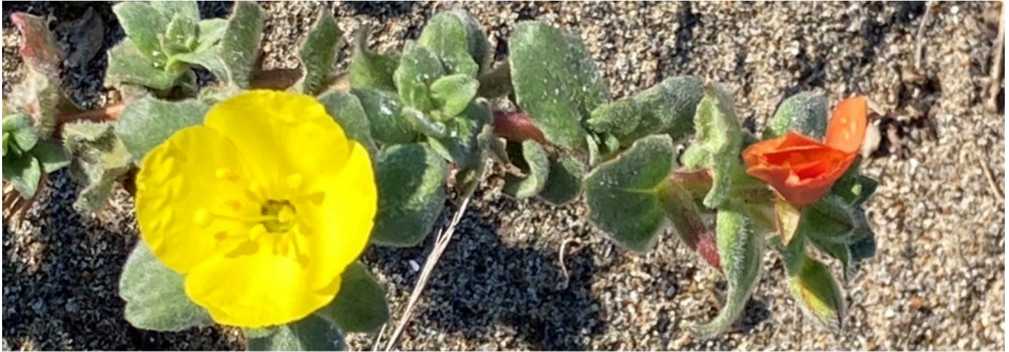
Camissoniopsis cheiranthifolia - beach evening primrose by Ann Elliott