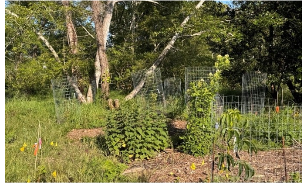
Alder Creek Preserve with flourishing natives & lots of weedy grass