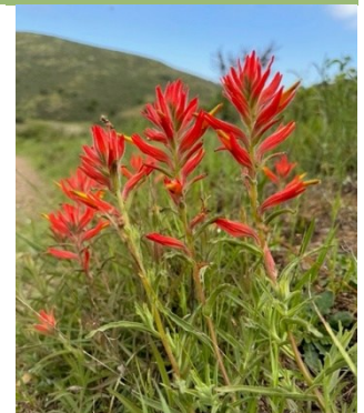
Castilleja subinclusa ssp. franciscana - Franciscan paintbrush in Tennessee Valley