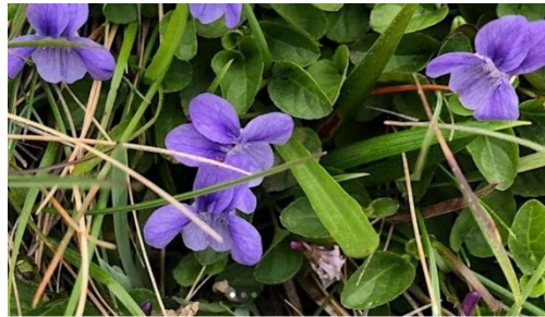
Viola adunca - Western dog violet Tanya Baxter

Habitat mapping of the host plant for the Myrtle Silverspot butterfly needs your help! We month effort to map Western National Seashore. A small counted week. The higher the density survival of the Myrtle this citizen science mapping and 23rd. Please register in advance for instructions.