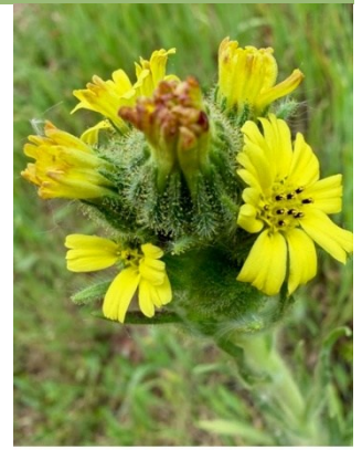
Madia sativa - coast tarweed in Tennessee Valley