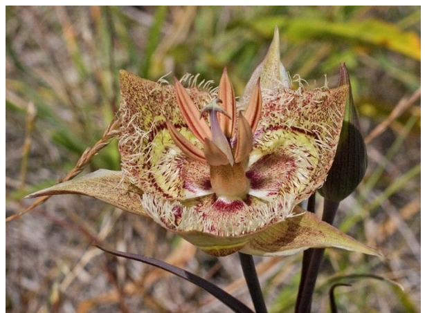
Calochortus tiburonensis - Tiburon Mariposa lily