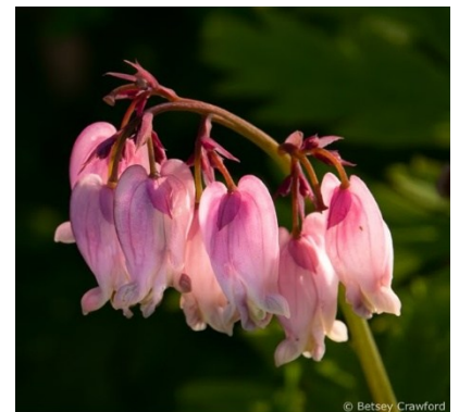
Dicentra formosa - Western bleeding heart Betsey Crawford