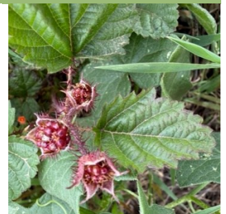
Rubus ursinus - CA blackberry in Tennessee Valley