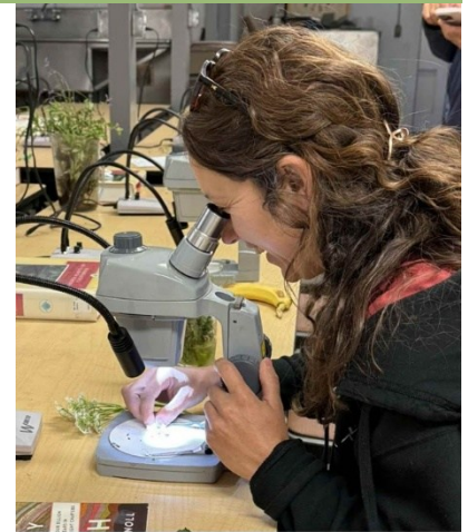
Plant keying sessions at Dominican.