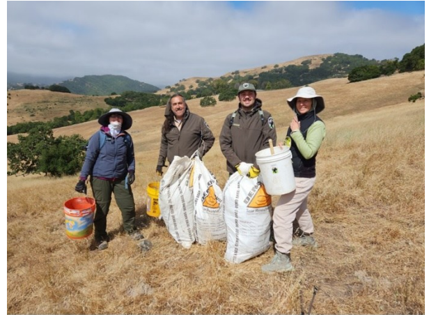
CNPS Marin volunteers and Marin Co. Parks staff bagging invasive weeds on Mt. Burdell

Join a community of habitat restorers! Marin CNPS is partnering with Marin County Open Space District staff to remove invasive species and improve native habitat at Mt. Burdell. Located at the northern edge of Novato, Mt. Burdell has serpentine grasslands with rare plants, an incredible array of oaks, and seasonal streams that support milkweed- the critical host for Monarch butterflies.