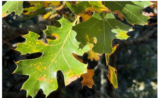
Quercus kelloggii - California black oak