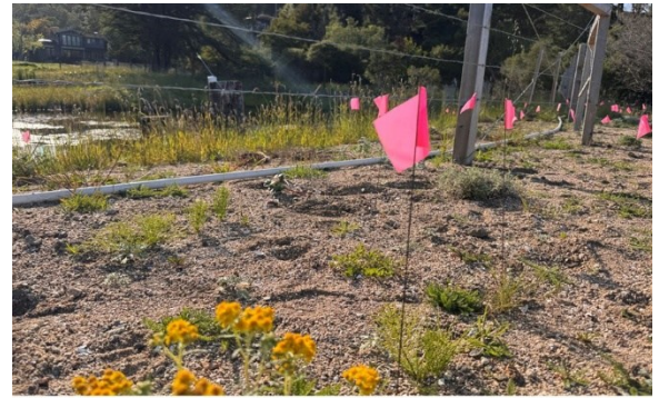
Eriophyllum confertiflorum - golden yarrow at Chicken Ranch Beach Wetland Restoration Ann Elliott

5/17 10 am – 3 pm Chapter Picnic at China Camp State Park