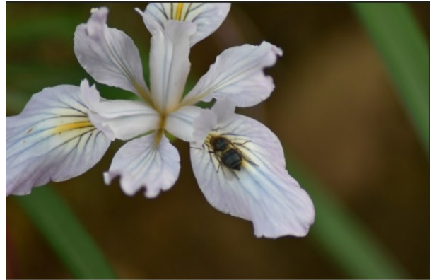
Iris with bee