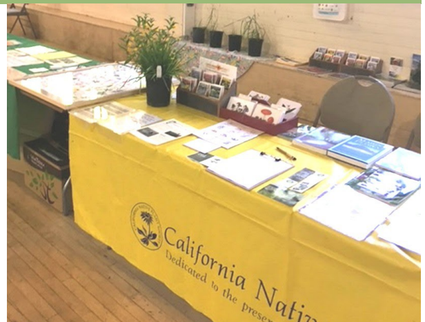
Fairfax Festival