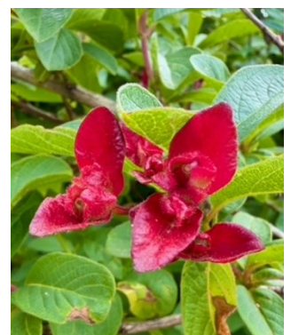
Lonicera involucrata - twinberry honeysuckle in Tennessee Valley