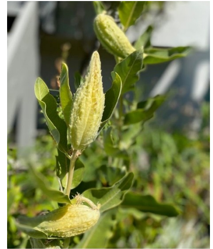
Asclepias speciosa - showy milkweed seedpods