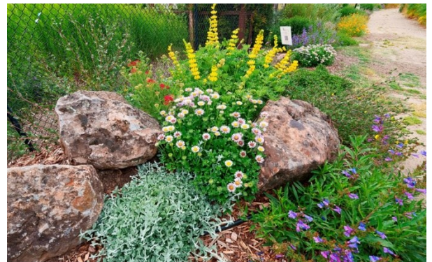
Native habitat garden near Town Park, Corte Madera by Refugia Marin