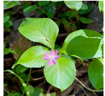
Lysimachia latifolia - Pacific starflower in Olompali SHP

We have a new Field Trip Template for 2026 to help us gather the information needed for the writeup.