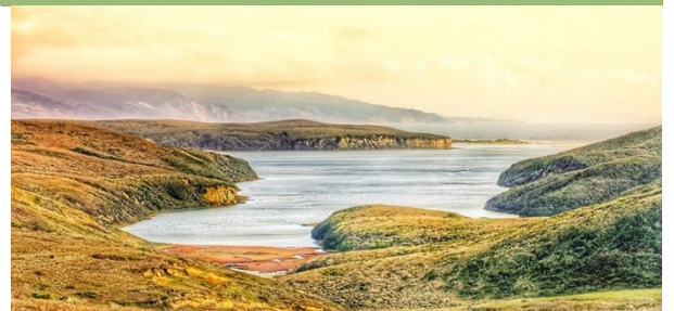
View across Creamery Bay to Bull Point, one area where targeted grazing will be occurring this summer and fall

Join us! Register for this Zoom meeting here .