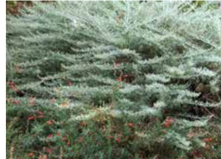
Las Pilitas Nursery