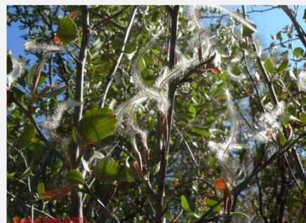
California Mountain Mahogany