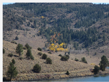
November Fall Colors Field Trip to Heenan Lake.

Reminder: There is no Newsletter in January.