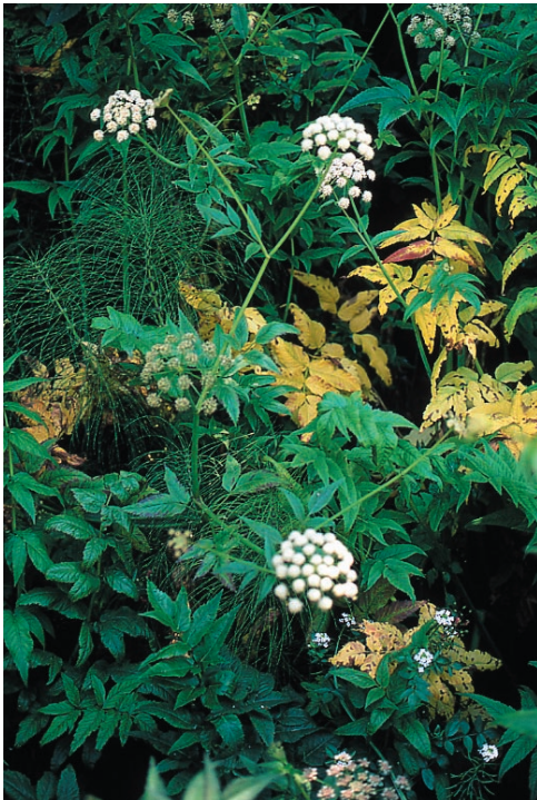
Below: Western water hemlock ( Cicuta douglasii )

Large plants from the Pt. Reyes wetlands bordering the salt marshes of bays and estuaries may be this taxon and are noted as such in the new (and old) Marin Flora . The key distinction between the two species of Cicuta in Marin requires one to examine the fruit for cryptic oil gland characters. Another distinction is the chromosome number of Cicuta douglasii , which is reported to be 2n=44 , while that of C. maculata var. bolanderi is 2n=22 , but that is even more difficult for the amateur to discover. Both the Cicuta species are deadly if even a small part is ingested, but just touching them doesn't affect most people.