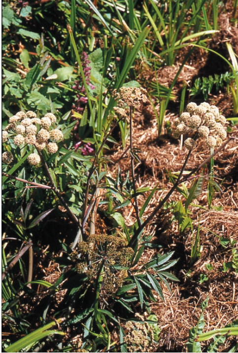
Above: Salt marsh water hemlock (rare) ( Cicuta maculata var. bolanderi )