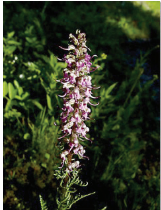
Above: Pedicularis groenlandica (Elephant's Head)