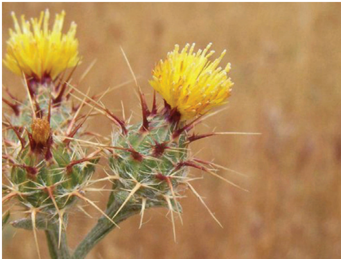
Above: Tocalote ( Centaurea melitensis)

Join Marin County Parks to help restore Ring Mountain. For several years, volunteers have helped remove tocalote ( Centaurea melitensis ), an invasive plant related to yellow star thistle, from sensitive habitat on the Ring Mountain Preserve. This event will directly benefit the preservation of the threatened Tiburon mariposa lily ( Calochortus tiburonensis ), and volunteers will likely be able to see this flower firsthand.