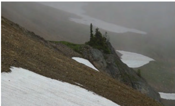
Above: Goat Rocks Wilderness, WA

The Pacific Crest National Scenic Trail extends 2,650 miles from the Sonoran Desert at the Mexican border to boreal forests in Canada. The entire route stays within some of the most strikingly beautiful and pristine habitats in the three westernmost states (California, Oregon, and Washington). Passing through some 50-odd national and state forests, parks, and wilderness areas, the trail winds up the Peninsular and Transverse ranges, across the western tip of the Mojave Desert and the Tehachapi Mountains, and along the length of the Sierra Nevada and the Cascade Mountains.