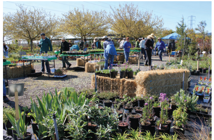
Above: Native plants and happy shoppers at our annual plant sale