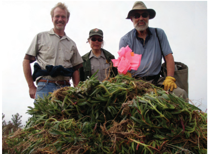
Above: Volunteers with a pile of pulled iceplant