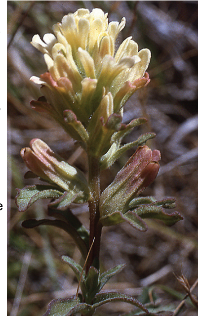
Above: Tiburon paintbrush ( Castilleja affinis ssp. neglecta ) (Tiburon form)

The Tiburon Old St. Hilary's and Gilmartin Preserve plants are threatened by off-trail bicycles, trampling, weedy grasses, and French broom. We should be concerned lest this iconic plant disappear from our neglect.