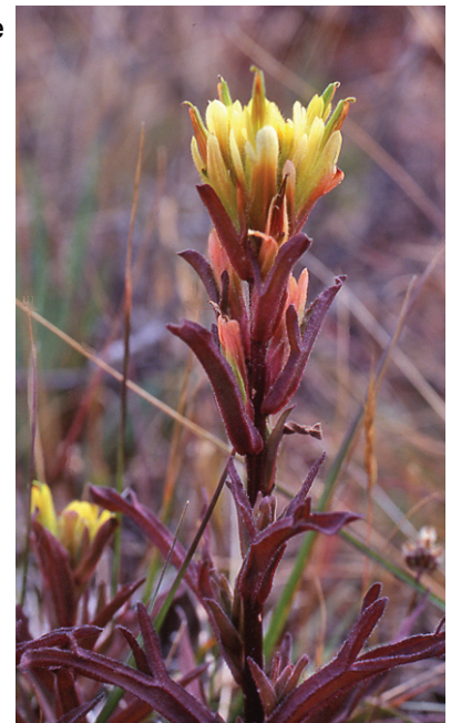
Above: Tiburon paintbrush (Nicasio Highlands form)