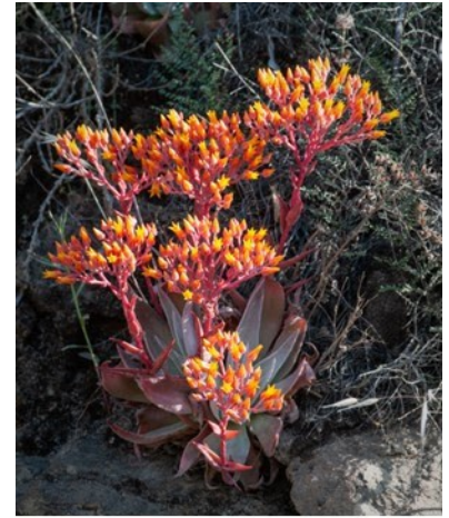
Dudleya cymosa - canyon live-forever