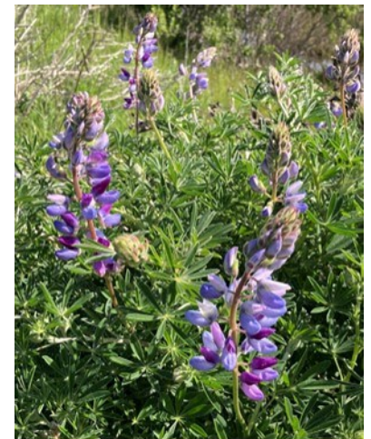
Lupinus arboreus - coastal bush lupine (blue) Tomales Bay Trail