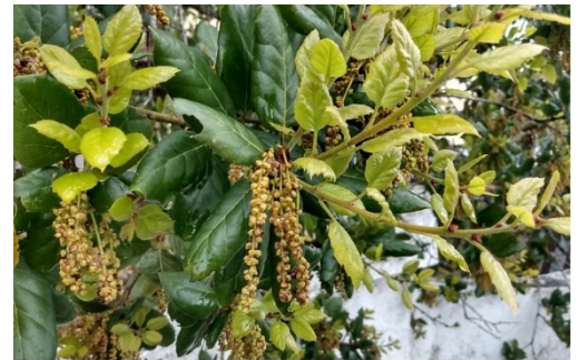
Quercus agrifolia - coast live oak catkins