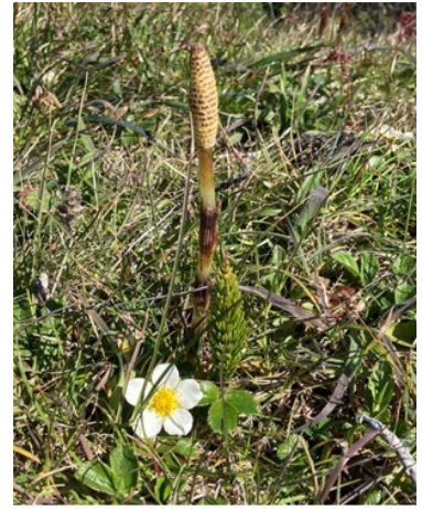
Equisetum telmateia - giant horsetail & beach strawberry Palomarin