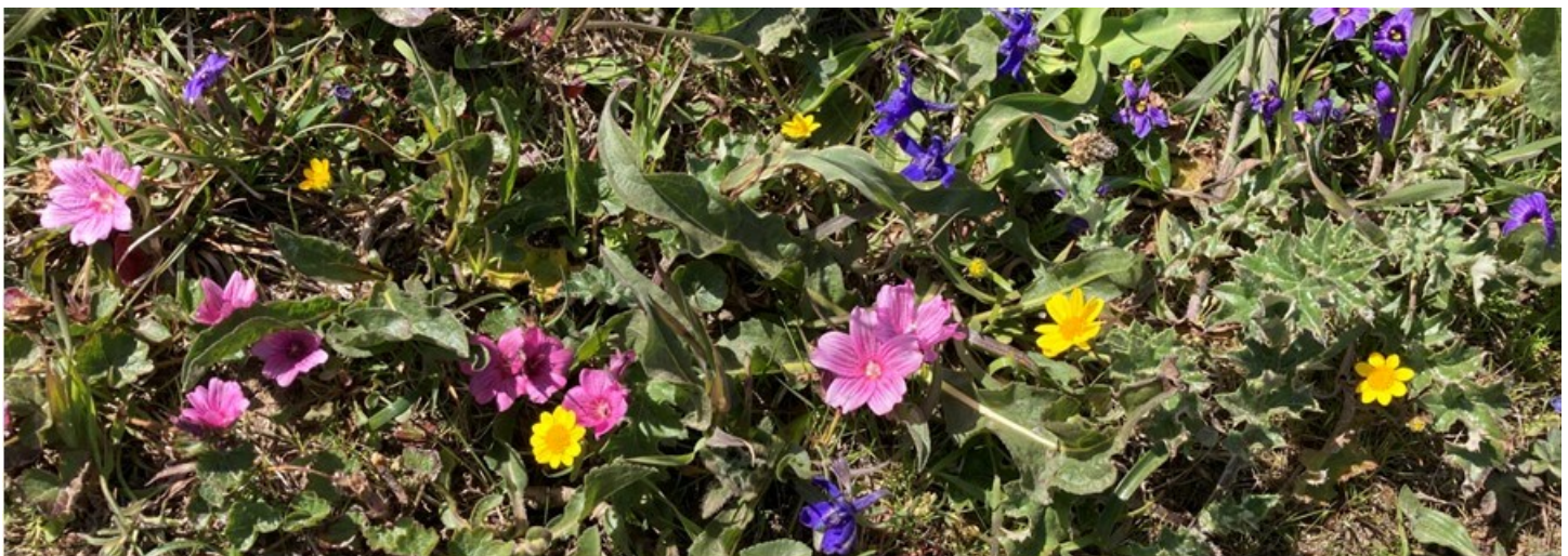
Superbloom! Checker bloom, goldfields, larkspur, blue eyed grass - Chimney Rock, Pt. Reyes NS