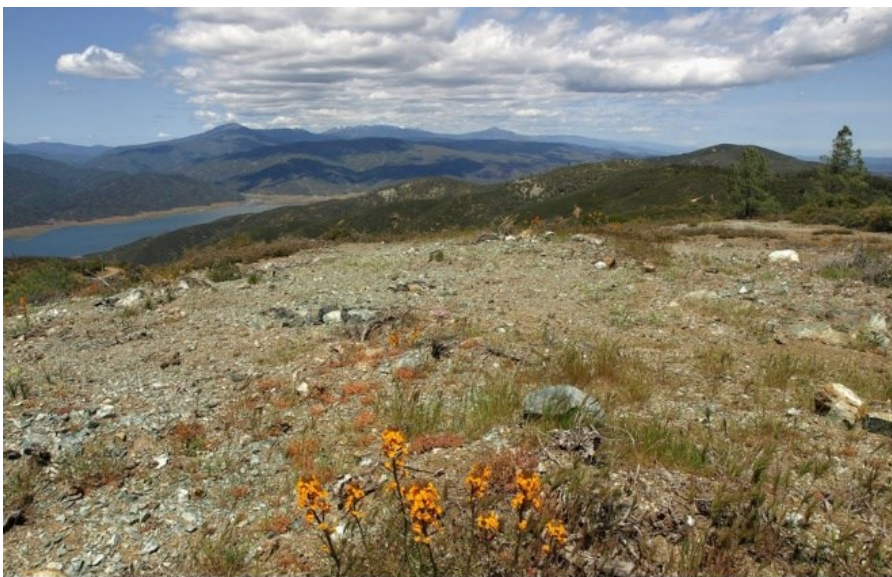
Serpentine Ridge on Molok Yuluk