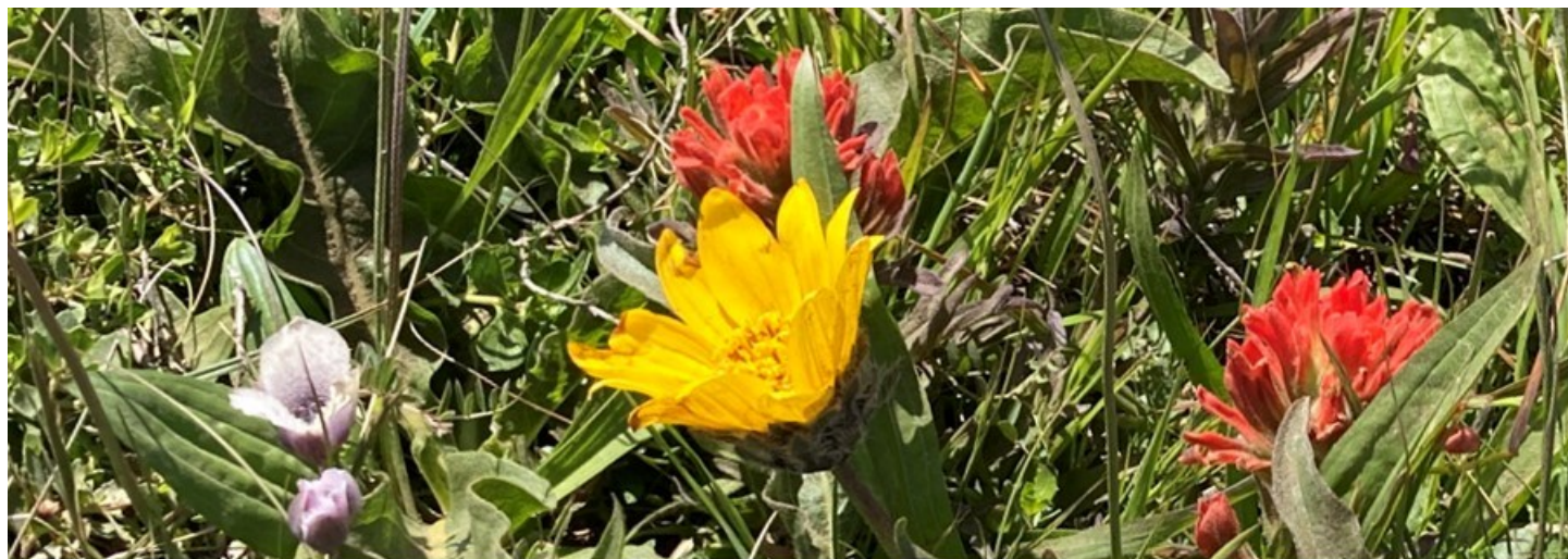
Superbloom! pussy ears, mule ears, paintbrush - Chimney Rock, Pt. Reyes NS