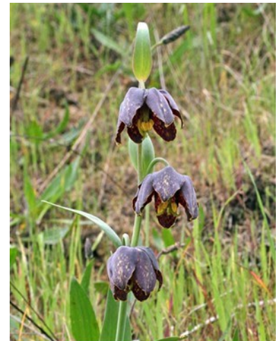
Fritillaria affinis - chocolate lily