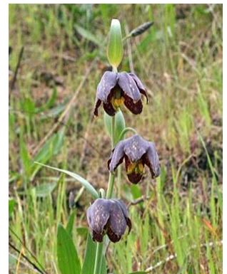
Fritillaria affinis - chocolate lily