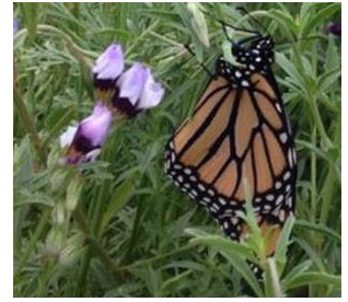
Monarch on Gilia tricolor

"Return of the Western Monarch Butterfly: A Photographic Exhibition and Scientific Roadmap for Protecting this Endangered Species" Exhibit at Marin Art & Garden Center March 17–April 30 . Fridays & Saturdays 10 am–4 pm, Sundays 12–4 pm