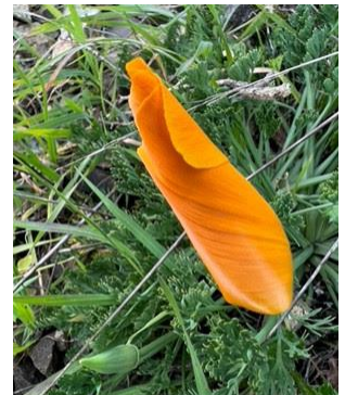
Eschscholzia californica California poppy in bud