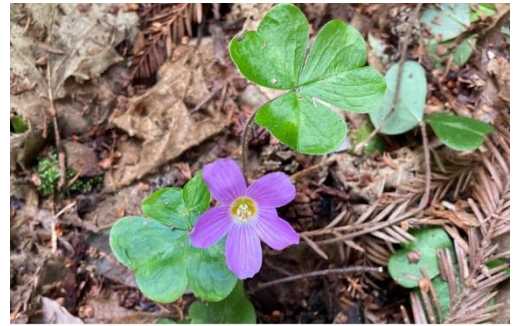
Oxalis oregano - Redwood Sorrel Samuel P Taylor SP