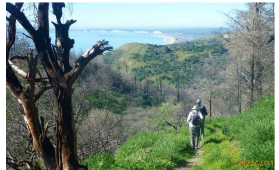
Woodward Fire Burn Scar By Woody Elliott