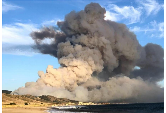
Woodward Fire from Limantour Beach