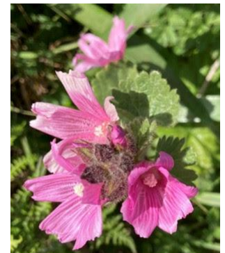
Sidalcea malviflora ssp. malviflora dwarf checkerbloom at Chimney Rock