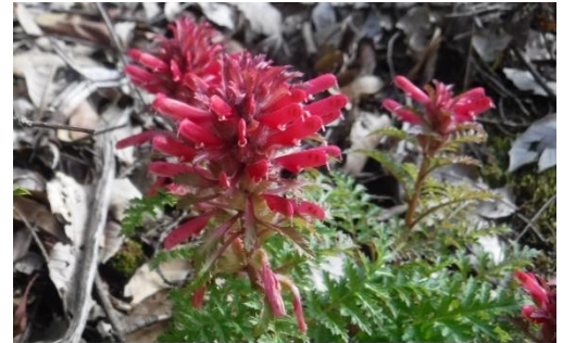
Pedicularis densiflora - warrior plumes at Lake Lagunitas