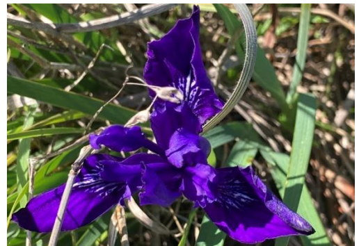
Iris douglasiana at Millerton Point