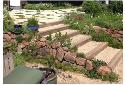
native plant borders and along steps

Let us know your interest by filling out this short questionnaire . We look forward to sharing information online and touring some gardens (in person or virtually).