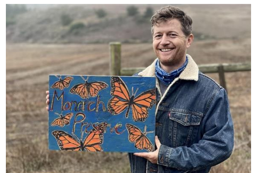
Ole Schell West Marin Monarch Sanctuary

Funds will be used for development of native plant gardens, their signage, and outreach materials. We will post grantee project information on our website and ask them to present a short talk at the Chapter's General Meeting in December.