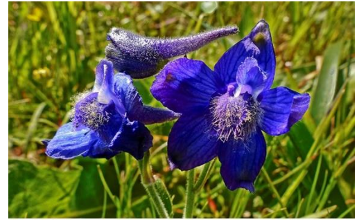
Delphinium decorum ssp. decorum - coastal larkspur at Chimney Rock