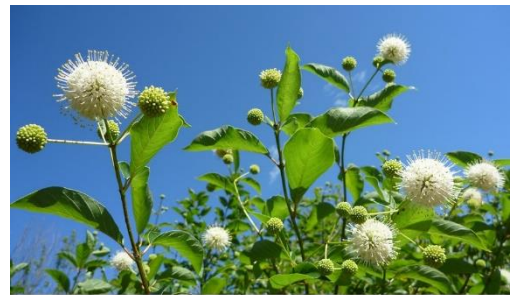
Cephalanthus occidentalis buttonbush

It's planting time! We are holding an online plant sale in April with order pickup in Greenbrae the following Saturday. Adequate rain means the spring wildflowers are coming along well and we'll be offering a big selection, as well as a discount for purchasing in quantity.