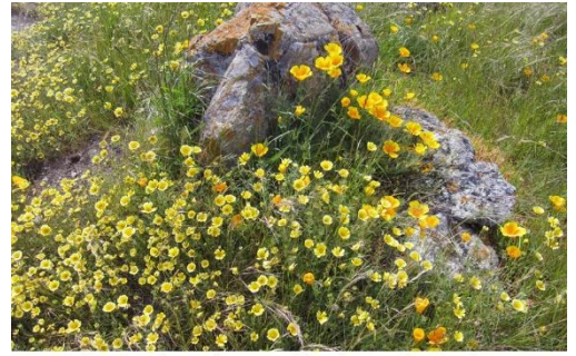
Layia platyglossa - tidy tips and poppies Ring Mountain

Become part of the first group of Ring Mountain Preserve Wildflower Docents. Join the Marin Chapter of CNPS and Marin County Parks for this fantastic opportunity to share your love of Ring Mountain's unique ecology, wildflowers, and unusual serpentine grassland habitat with the general public, while also fostering stewardship of this Marin landmark. The program will run weekends from April through mid-June 2023, with training in March. No experience is necessary, but familiarity with native plants is helpful.