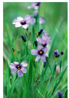
Sisyinchium bellum - blue-eyed grass