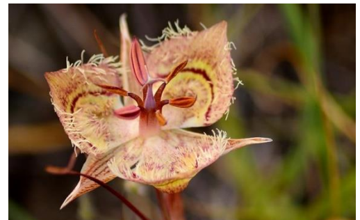
Calochortus tiburonensis - Tiburon mariposa lily

Sign up for the new member discount of 40% for yourself or a friend through January 10, 2023. Please use this link through the CNPS store. The discount is applied at checkout.