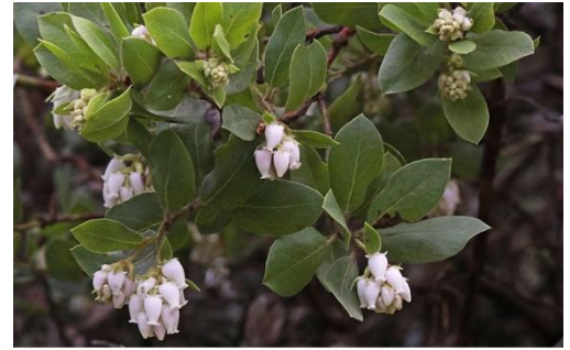
Arctostaphylos virgata - Marin manzanita

Download the PLANT LIST for near this area. Read more about this field trip. . .