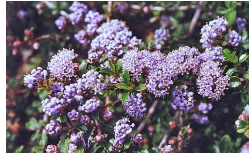
Ceanothus gloriosus var. porrectus Mt. Vision Ceanothus