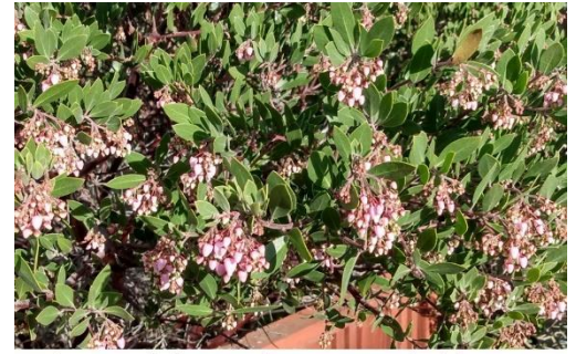
Arctostaphylos sp. - showy manzanita blossoms adorn fence