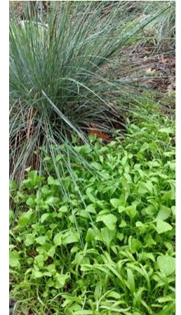
Festuca californica & Claytonia perfoliata, CA fescue & miner's lettuce