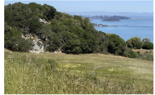
Ring Mountain Open Space Preserve