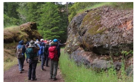
new Streptanthus sp. Kent Pump Rd. By Susan Schlosser