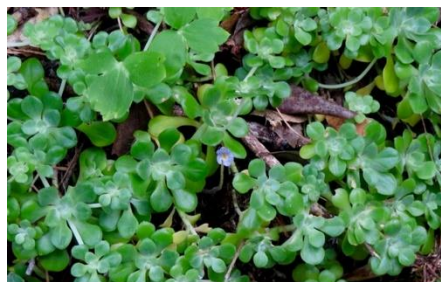
Aphyllon purpureum - sedum spathulifolium Kent Pump Rd. By Susan Schlosser