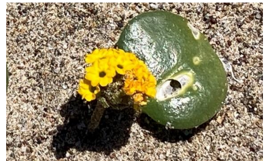
Abronia latifolia - yellow sand verbena

Abbott's Lagoon at Point Reyes National Seashore is of special interest to CNPS for several reasons. It has a remarkable diversity of plant habitats. Marsh, coastal scrub, headlands and coastal dune are in close proximity and easily accessible. It also has several rare plant species that may be found at this time of year. Furthermore, recognizing the severe threats facing the dune habitat from invasive plant species, the National Park Service has made this habitat a priority for restoration, and has mounted strong campaigns to remove the most important invasive plants, in which many CNPS members have participated. The dune habitat will be the major focus of this trip, although some of the other habitats may be visited as well.