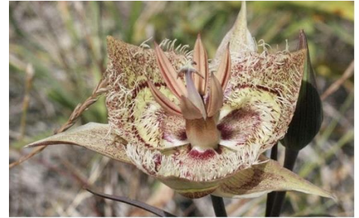
Calochortus tiburonensis - Tiburon mariposa lily By Vernon Smith

This annual outing showcases several of this Marin County Open Space preserve's rare plants, including Tiburon mariposa lily ( Calochortus tiburonensis ), found only at this location, and Marin dwarf flax ( Hesperolinon congestum ). Other lovely flowers we can expect to see include Ithurriel's spear ( Triteleia laxa ) and farewell-to-spring ( Clarkia rubicunda ). Starting at 4 p.m. participants will be treated to the delightful sight of clouds of the whitish starry flowers of soap plant ( Chlorogalum pomeridianum ) which seem to hover over the grasses. The many notable native, and relatively few non-native grasses will also be appreciated on