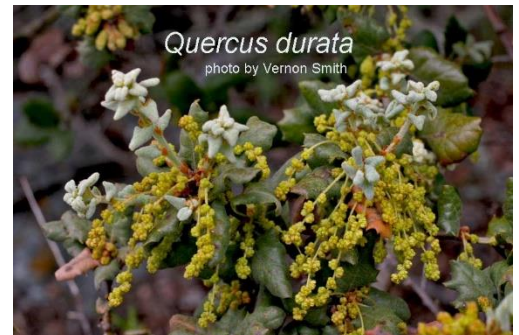
Quercus durata

Serpentine is less than 2% of the land area of California but accounts for about 15% of the rare plants. Join me for a walk on Carson Ridge through serpentine chaparral. We'll meet at the Azalea Hill parking area, on Bolinas-Fairfax road, 4 miles from Fairfax. I'm tentatively planning a loop hike of 3.5 miles, out Pine Mountain Fire Road, Oat Hill Fire Road, Old Sled Trail and then back to the parking area. However, if we are enjoying a slower pace we can make it a shorter out and back hike. There is some up and down on the whole loop, but the first half mile is fairly flat for those who want to just join us for the first bit and skip the climbing.