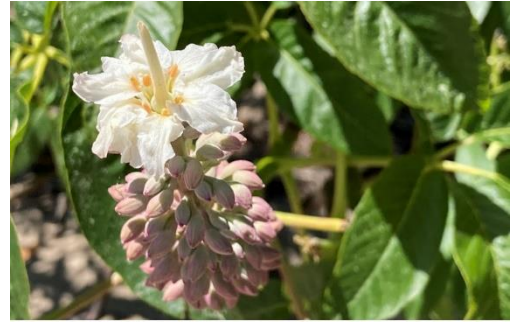
Aesculus californica - California buckeye Showing just terminal flower open. By Ann Elliott

Marin Chapter is honored to host the first hybrid statewide CNPS Chapter Council Quarterly Meeting since the pandemic. Location: The Dance Palace in Pt. Reyes Station.