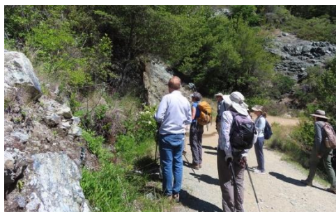
serpentine seep along Old Stage Road on Mt. Tamalpais By Susan Schlosser