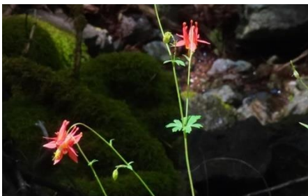
Aquilegia formosa - western columbine Kent Pump Road By Susan Schlosser