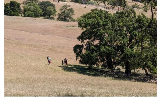
Work Party Removing Yellow Star Thistle from Mt. Burdell By David Fiol

A small yet dedicated group met Saturday May 14th to remove invasive yellow star thistle, Centaurea solstitialis , from two areas on Mount Burdell. CNPS is partnering with Marin County Open Space District in some invasive plant removal work parties in Novato. The yellow star thistle, surprisingly easy to pull in most cases, was just starting to flower and we were able to pull all the flowering individuals that we could find. We need to return several times over the next several months as more plants start to flower. Yellow star thistle is a late bloomer! If you are interested to participate in this effort (or other work parties in Novato that are yet to be planned) please contact Stacey Pogorzelski by email at staceypogo@gmail.com .