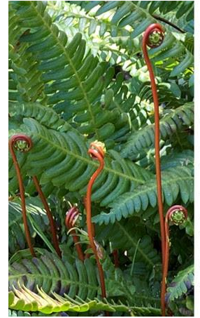
Struthiopteris spicant - deer fern - Ann Elliott