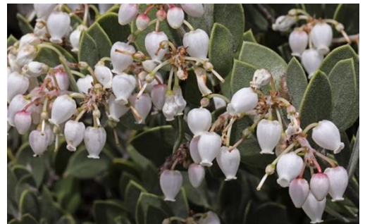
Arctostaphylos montana ssp. montana - Mt. Tamalpais manzanita