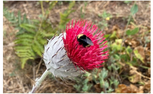
Cirsium occidentale var. occidentale - cobweb thistle Abbott's Lagoon Tr.

CA State Senator Mike McGuire represents Marin County. Email him: senator.mcguire@senate.ca.gov