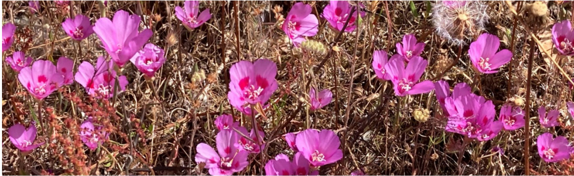
Clarkia amoena ssp. huntiana Arroyo Sausal Rd