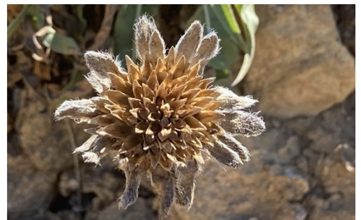
Wyethia angustifolia - faded flower/seed head of narrow leaf mule ears Big Rock Trail by Ann Elliott