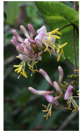
Lonicera hispidula - CA honeysuckle

Go west on Sir Francis Drake Blvd. several miles past Inverness, up the hill. At the fork in the road, bear right on Pierce Point Rd. and go about a mile. Meet at the (unsigned) small parking area at the top of the Jepson Trail. If you reach the entrance to Tomales Bay State Park, turn around and go back 100–200 yards.