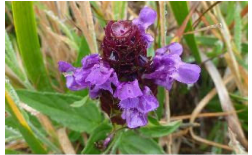
Prunella vulgaris var. lanceolata Bull Point Tr.