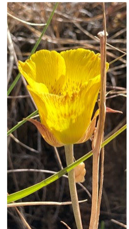
Calochortus luteus - yellow mariposa lily Azalea Hill Tr.

Check here for more volunteer opportunities.