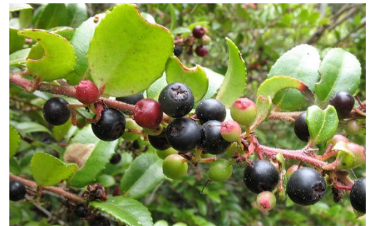
Vaccinium ovatum - CA huckleberry by Vernon Smith