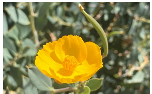
Dendromecon rigida - bush poppy flower & seed pod Big Rock Trail by Ann Elliott

Next time you are in your garden or out in the wilds keep your eyes out for different kinds of seeds. Think about how each seed might get dispersed (by gravity, wind, water, or animals)