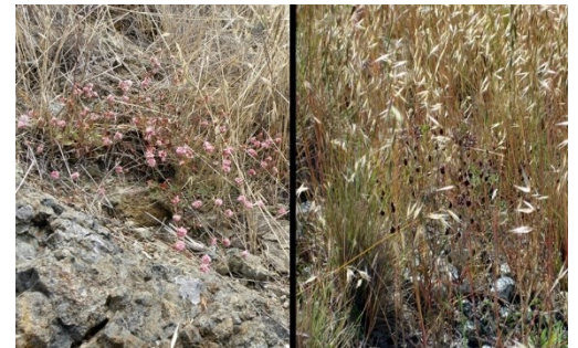
Invasive grasses out-competing special-status species on Tiburon Middle Ridge by Eva Buxton