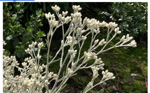
Pseudognaphalium californicum - California everlasting