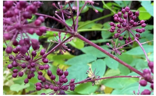
Aralia californica - elk clover

Please promote our events and engagement on your social media.