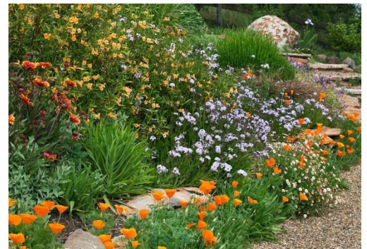
Charlotte Torgovitsky's garden by Saxon Holt