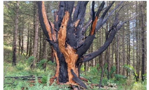
Pseudotsuga menziesii - Douglas fir in Woodward Fire

Before we understood the significance of wildland fire, we put out wildfires as quickly as we could. Now, because too much fuel has built up and climate is changing, some areas are burning too hot and too often. Explore the role of fire and how we can safely return fire to the natural cycle in ecosystems.