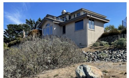
Echium candicans (Pride of Madeira) invading Tiburon Middle Ridge from neighbors - Eva Buxton