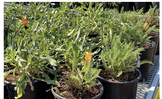
plants ready for packing at Home Ground Habitats

The recent soaking Northern California received was perfect for native plants in the wild and in our gardens. Thank you to all who supported the Chapter with purchases at our Fall Online Native Plant Sale. If you have not got your plants in the ground yet, do it soon.