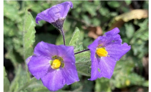
Solanum xanti - blue witch nightshade by Ann Elliott

Please vote at the upcoming Chapter Meeting to acknowledge our dedicated volunteers!