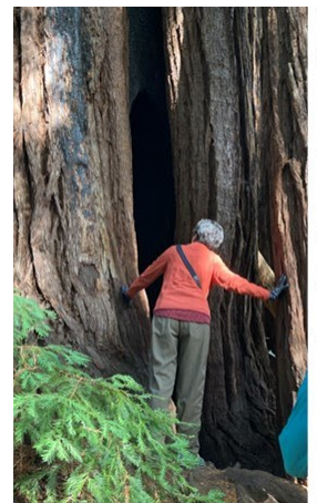
Sequoia sempervirens - The Pioneer Tree - Ann Elliott