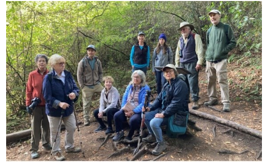
Pioneer Tree Trail in Samuel P. Taylor State Park by Ann Elliott

Turtle Back Trail at China Camp State Park Sun. Nov. 14 @ 10:00 am Enjoy a late fall stroll around Turtle Back Trail. This area is interesting year round. We will search for a few lingering flowers, appreciate fall color in the oak woodland, and explore the edges of the tidal marsh.