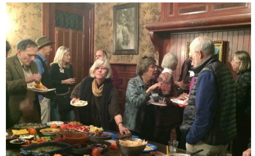
Marin CNPS Member Appreciation Event in 2017

For the second year in a row, we have reluctantly canceled our annual November party for friends and members, held at Falkirk Cultural Center. This is our yearly chance to treat all of you and thank you for your generous support of our chapter in ways large and small. We miss you! We love hearing what you are up to and the ideas you have for our organization. Hopes are high for safe resumption of large gatherings by spring. In the meantime, keep an eye on this newsletter for word of upcoming activities and enjoy watching your garden come to life after the lovely downpour we got!