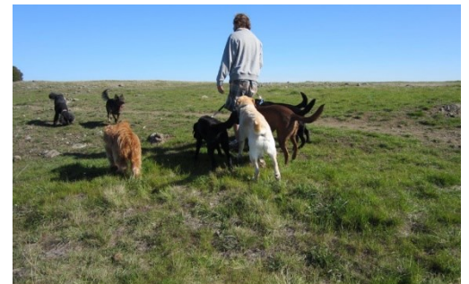
Heavy use by professional dog walkers damages Tiburon Middle Ridge.