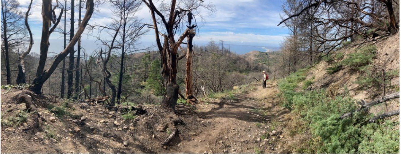
Woodward Fire Scar, Point Reyes National Seashore - by Ann Elliott