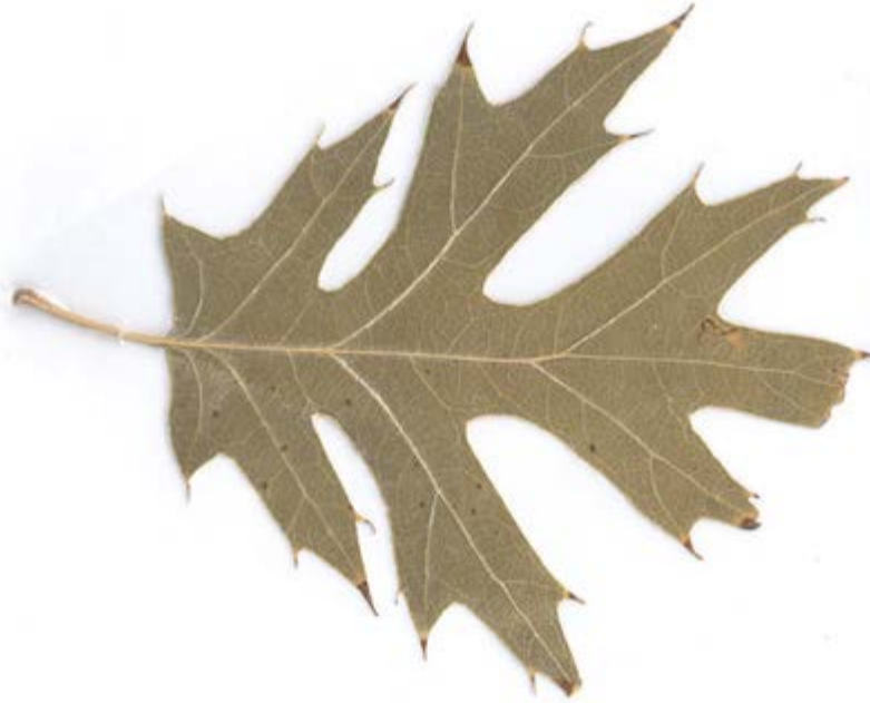
Leaf is 3/4 actual size