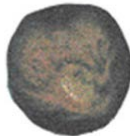
Leaf and Fruit 3/4 actual size