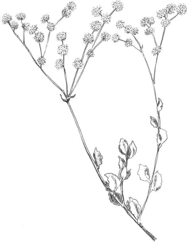
Above: Buckwheat ( Eriogonum )

If you have ever admired a flowering buckwheat as it clung to a coastal cliffside, brightened a mountain slope, or filled a sandy wash, you might consider celebrating the genus Eriogonum in your garden. With about 125 species native to California, buckwheats range from large woody shrubs to herbaceous perennials and subshrubs and even annuals. In the wild, buckwheats favor open sunny banks and rocky hill-sides; in the garden, they need sun and a well-drained sandy soil.