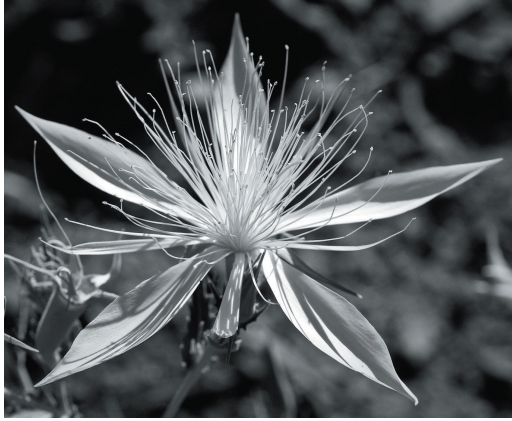
Above: Giant blazing star ( Mentzelia laevicaulis)

interest, he also enjoys shooting wildflowers, butterflies, dragonflies, and other critters.