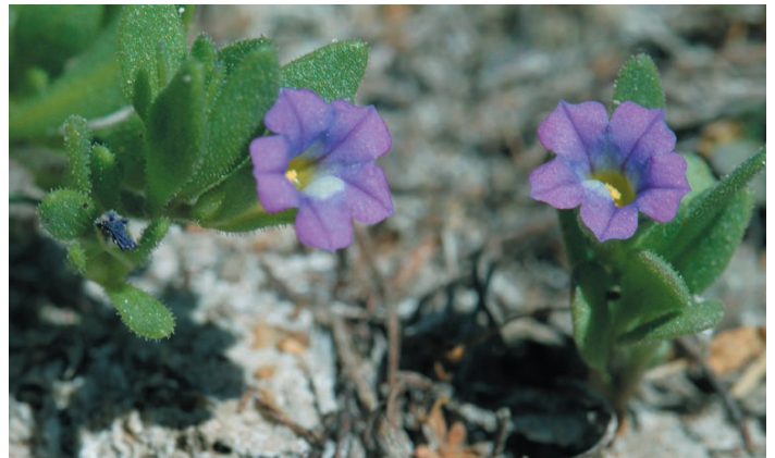
Above: Wild petunia ( Petunia parviflora )

Last year, while on a field trip to Stafford Lake Park in Novato, we found a new native plant species for Marin, a very small petunia, Petunia parviflora , a.k.a. Calibrachoa parviflora . This annual field trip was to look for late-blooming plants; the dried muddy reservoir shores are home to several species not otherwise seen in the County.