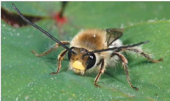
Above: Eucera lunata