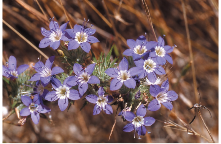
Above: Sticky navarretia ( Navarretia viscidula )

The most likely place to discover this small but beautiful wildflower is in the area of Lagunitas Meadows, on the MMWD Sky Oaks property, near Fairfax. Other places where it has been seen are the top of Big Rock Ridge and at Indian Valley, Novato, near the sports field.