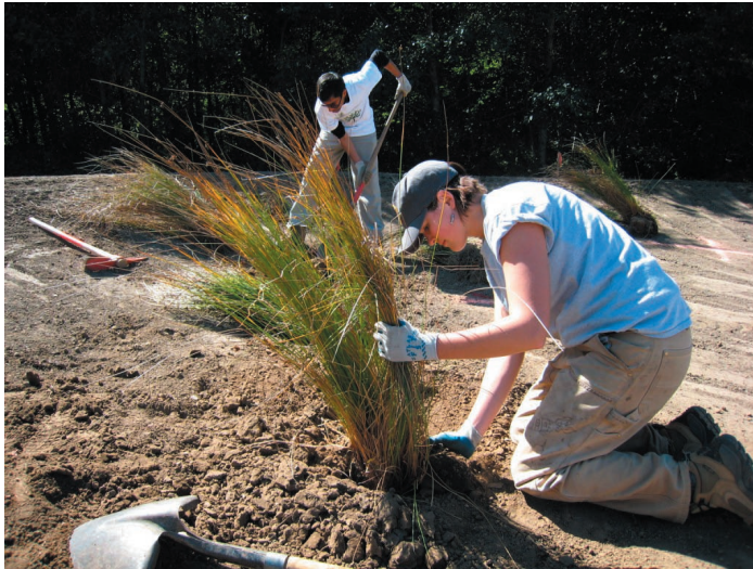
Above: Photo of an Intern planting Juncus at a newly excavated frog pond

re-vegetation of several restoration sites in the Redwood Creek watershed. Soon, he will take on a new role with the National Park Service as vegetation ecologist for the Muir Beach Restoration Project.