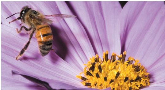
Above: Honeybee ( Apis)