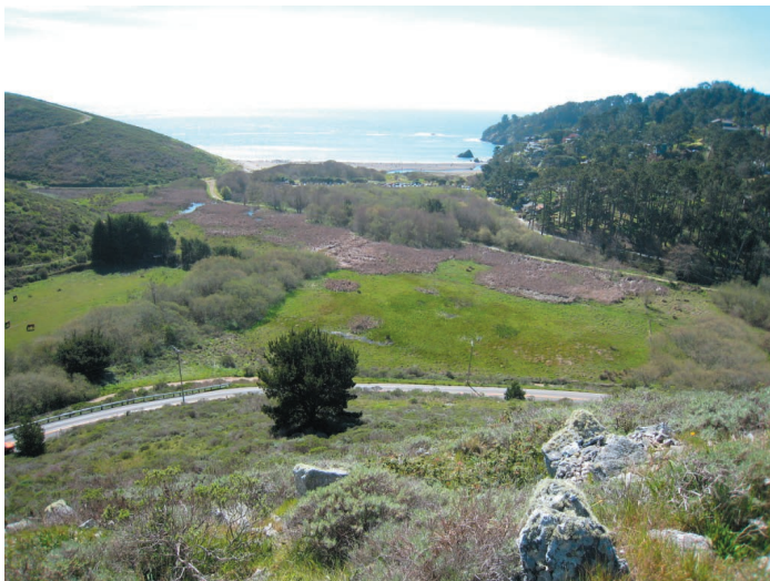
Above: Photo of the Muir Beach project area