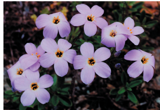
Above: Leptosiphon androsaceus (typical form)

The plants occur in one large population along the Alpine Dam to Kent Lake pump road in a partly-shaded opening in the forest. They flower in early May and have white, pink, or mauve petals like Leptosiphon androsaceus . However, they lack the constricted purple throat of flowers typical of that species in Marin. They have instead a wide bowl-shaped golden throat like L. parviflorus . In the new edition of the Marin Flora , the plants are mentioned as “anomalous”, but put with L. androsaceus .