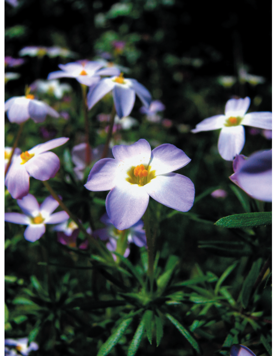
Above: Leptosiphon androsaceus (anomalous form)

An unresearched, perhaps new, Leptosiphon species in Marin? The genus Leptosiphon ( Linanthus ) has many localized populations of plants that have caught the attention of botanists because of some difference from the type or “usual form” of any particular taxon in this genus. Marin has one that I am featuring here.